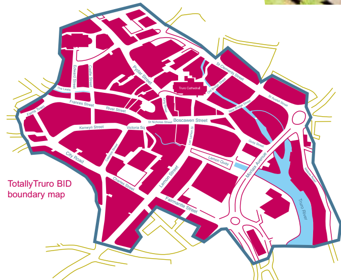
TotallyTruro BID boundary map